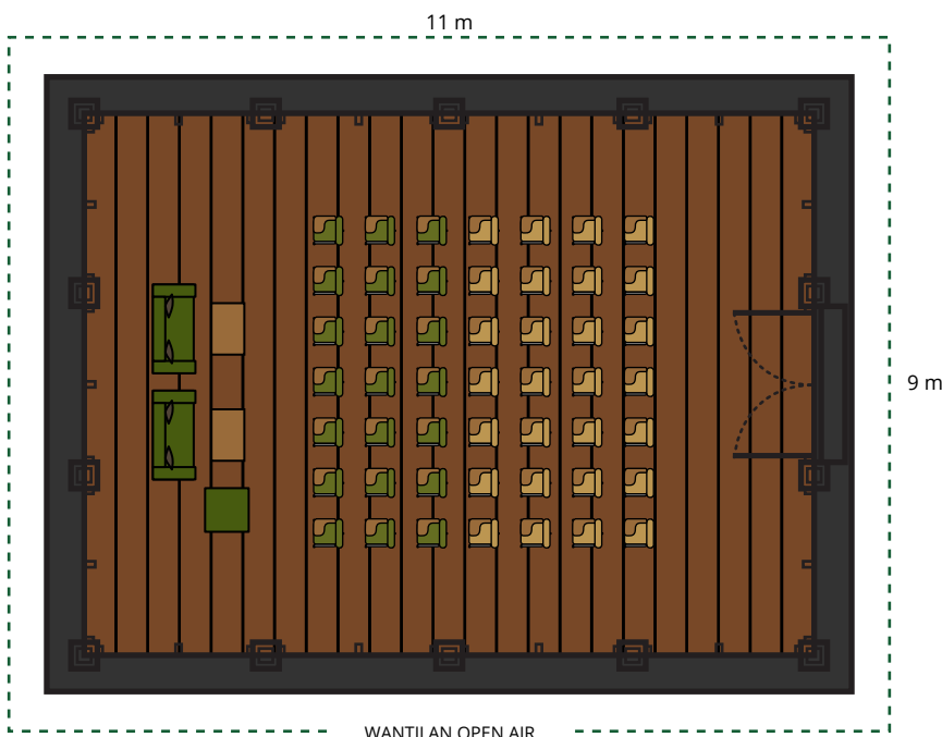
WANTILAN OPEN AIR